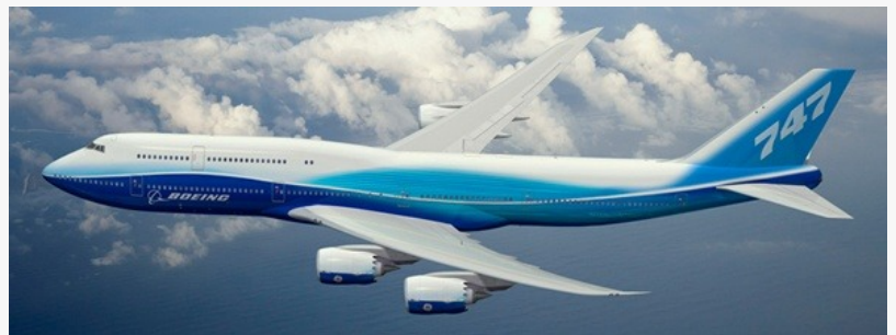
Boeing 747-8 passenger aircraft gets new life

On November 19th, Avatar filed for a 121 certificate with the FAA and the Department of Transportation for a Certificate of Public Convenience and Necessity for the authority to operate low-fare scheduled service to large major city pairs throughout the U.S. and Hawaii. Avatar will begin with 14 747-400s transitioning to the 747-8 which it considers to be the ideal aircraft to replace the 400s. Management believes the -8 will provide an increase in both passenger and freight capacity while operating at significantly lower costs adding to its net profits.