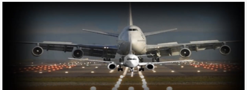
Bigger is Better